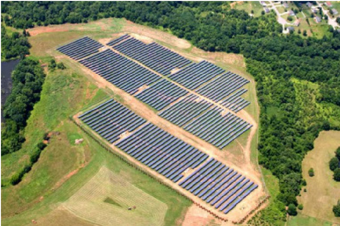
Figure 1: Utility-scale solar facility (5 MWAC) located in Catawba County.

The system installation, or construction, process does not require toxic chemicals or processes. The site is mechanically cleared of large vegetation, fences are constructed, and the land is surveyed to layout exact installation locations. Trenches for underground wiring are dug and support posts are driven into the ground. The solar panels are bolted to steel and aluminum support structures and wired together. Inverter pads are installed, and an inverter and transformer are installed on each pad. Once everything is connected, the system is tested, and only then turned on.