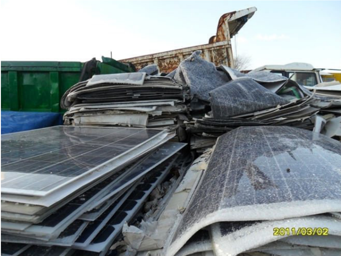
Figure 4: The mangled PV panels in this picture illustrate the nature of broken solar panels; the glass cracks but the panel is still in one piece.

PV panels constructed with the same basic components as modern panels have been installed across the globe for well over thirty years. 3 The long-term durability and performance demonstrated over these decades, as well as the results of accelerated lifetime testing, helped lead to an industry standard 25-year power production warranty for PV panels. These power warranties warrant a PV panel to produce at least 80% of their original nameplate production after 25 years of use. A recent SolarCity and DNV GL study reported that today's quality PV panels should be expected to reliably and efficiently produce power for thirty-five years. 4